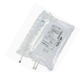
Calcium-Free Bicarbonate Solution

Three different bicarbonate formulas for hypo- or hypercatabolic patients 0 – 2 or 4 K +