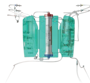
OMNIset incl. plasmafilter*

Full size range including 0.3* – 0.8 – 1.2 – 1.6 sq